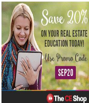
The CE Shop